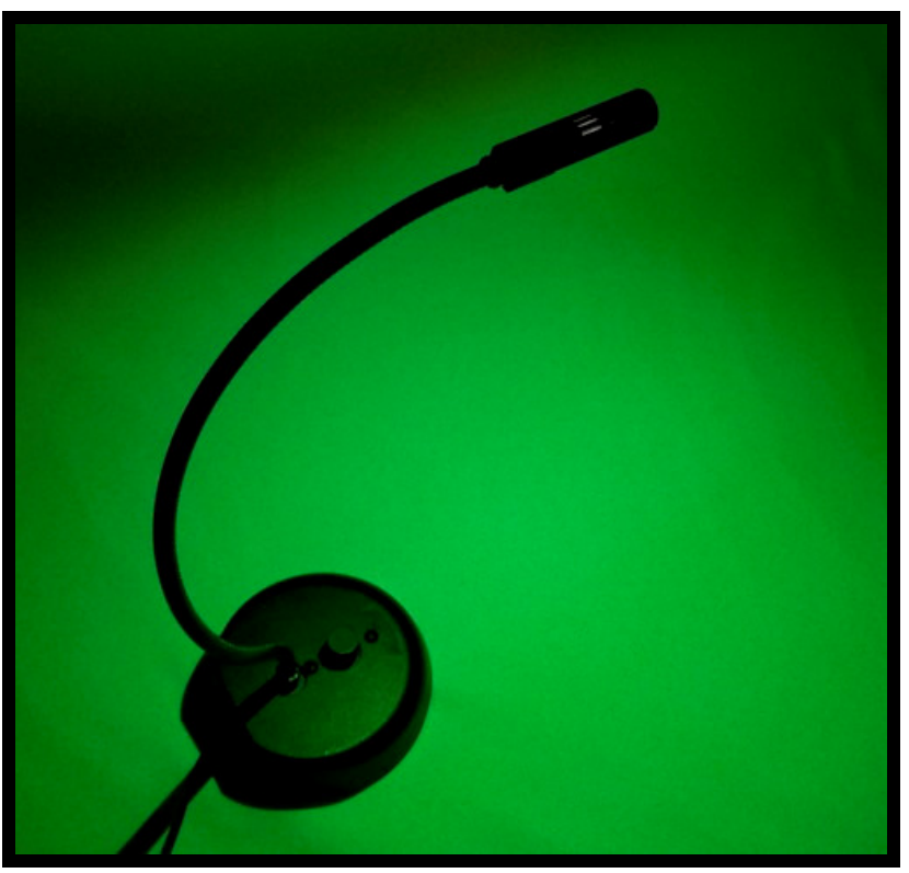
And you're done!

If you have questions regard this process, please contact the factory at (810) 852-4242 or info@littlite.com. www.littlite.com