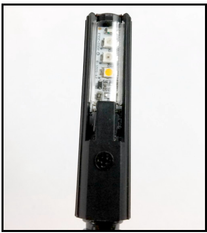
Littlite LED Hood with Lens

Littlite GEN V LED lights have a removable snap-in clear lens with built in ridges that enable you to add a small piece of colored light gel.